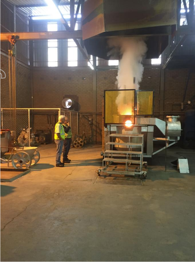
Figure 1 Gold being prepared for pouring